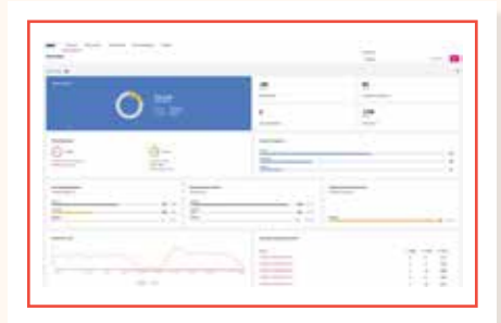
Ease the burden on your IT team.

Periodic security training often falls short with distracted, busy users. INKY's Email Assistant provides continuous coaching, helping users make safe choices on any device or email client.