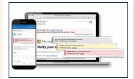
Coach users to make smart decisions - everywhere, all the time

Detect the behaviors of the most sophisticated attackers with technology that's always getting smarter to keep you ahead of brand forgery and account takeovers.